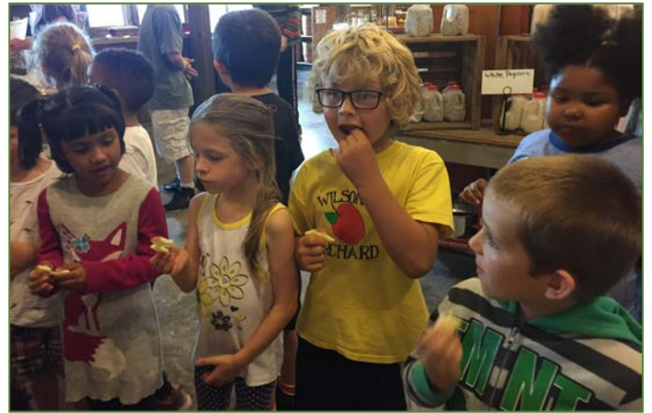
Above: Kindergarteners visit Wilson's Apple Orchard. Below: Students participate in Horn Olympics.